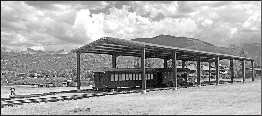
The canopy at the Ridgway RR Museum with two cars on blocks and Galloping Goose #1 on the through track on July 10, 2018.